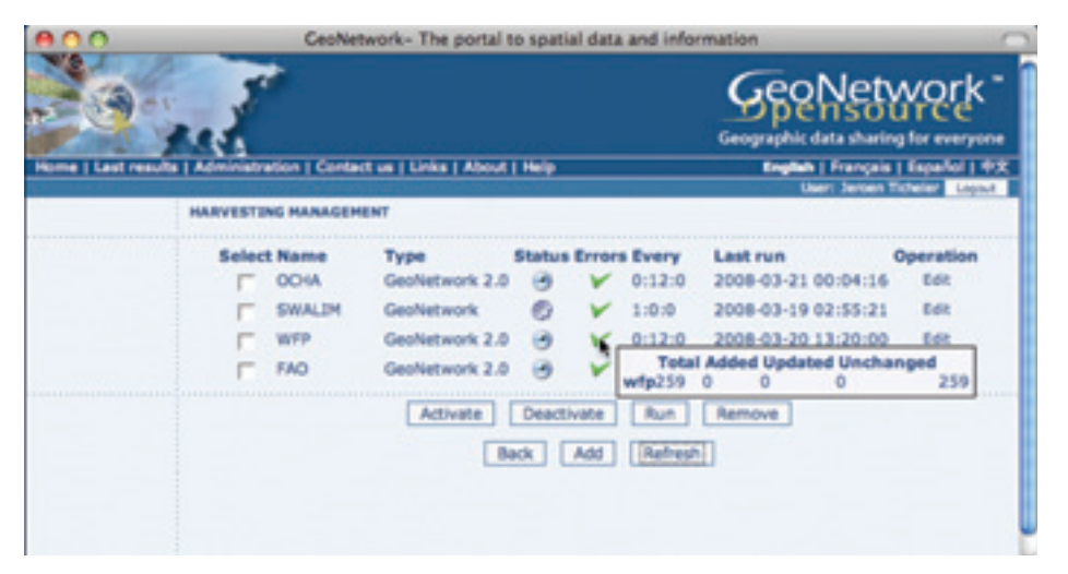
FIGURE 1: Harvesting Management in GeoNetwork