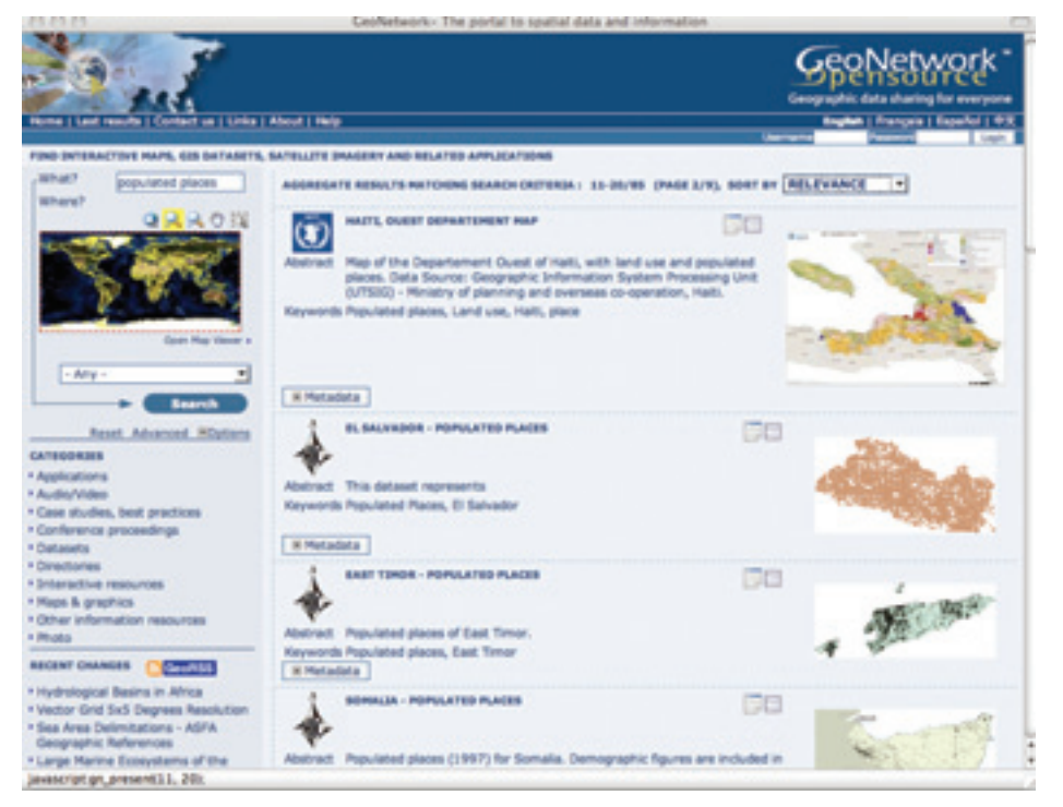
FIGURE 2: GeoNetwork catalogue search example]

To ensure long term sustainability of the project and to ensure the project meets the expectations of a larger audience, the GeoNetwork Advisory Board decided in 2006 to move the project out of the UN and into the newly established Open Source Geospatial Foundation (OSGeo). A Project Steering Committee (PSC), established in 2007 for day-to-day management of the project, consisting of 7 active community members, evaluates proposals for new functionality, decides on new releases and approves new software developers with direct write access on the project's source code repository. The software is released under the GNU GPL license. The most recent release is version 2.2.0 (March 2008).