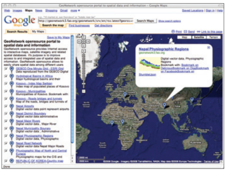
FIGURE 5: GeoRSS output on Google

Dublin Core: dublincore.org/ FAO GeoNetwork: www.fao.org/geonetwork FGDC: www.fgdc.gov/ GeoNetwork opensource: geonetwork-