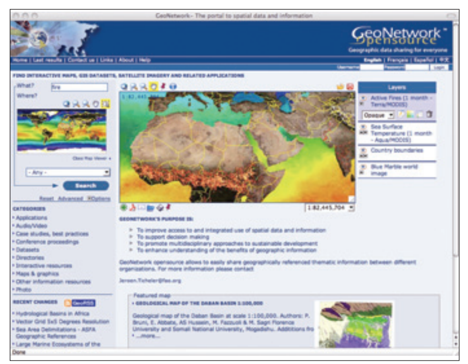
FIGURE 3: MapViewer catalogue